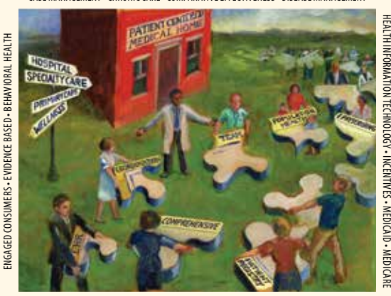
PATIENT ADVOCACY • PAYMENT REFORM • PHYSICIAN DIRECTED • PREVENTIVE CARE • WHOLE PERSON

CASE MANAGEMENT • CHRONIC CARE • COMPARATIVE EFFECTIVENESS • DISEASE MANAGEMENT