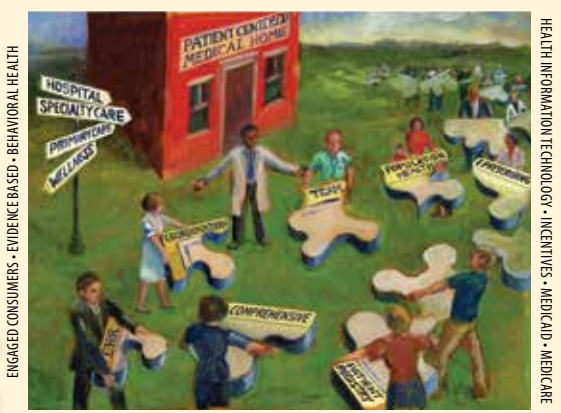
{\tt PATIENT\,ADVOCACY\, \bullet\, PAYMENT\, REFORM\, \bullet\, PHYSICIAN\, DIRECTED\, \bullet\, PREVENTIVE\, CARE\, \bullet\, WHOLE\, PERSON}

CASE MANAGEMENT • CHRONIC CARE • COMPARATIVE EFFECTIVENESS • DISEASE MANAGEMENT