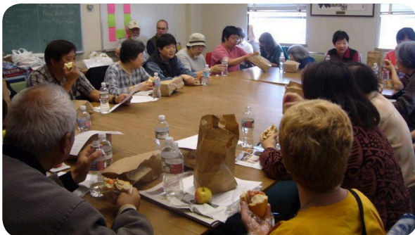
(above) Patient and family advisors at Ocean Park Health Center, San Francisco, CA

Research has shown that input from patients and families on care delivery and the implementation of Patient & Family Engagement strategies directly impacts quality. Health reform efforts are shifting providers' financial incentives from fee-for-service to payment for health outcomes (value-based payment & alternative payment models). Success in a value-based payment contract requires a progressive population health strategy. Best practice models of population health align health systems with community-based organizations to synergize efforts to address the health of targeted health risks in the community. This section provides resources for practice administrators, community-based organizations and quality improvement advisors on incorporating patient engagement strategies to drive performance.