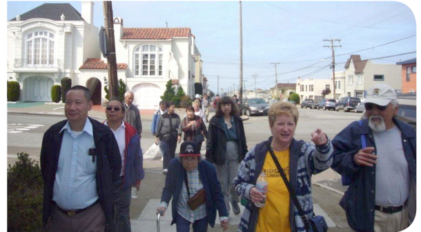
(above) Patient and family advisors at Ocean Park Health Center planned a "Walk and Talk" series

If you are a clinician/provider or a member of the care team looking for a guide on how to partner with patients and families, you're in the right place.