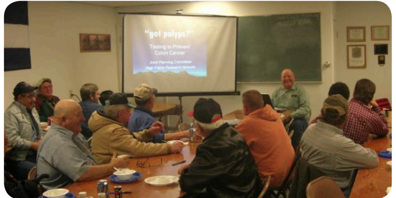
(above) Community Advisory Council at the local gun club in rural Colorado to prevent colon cancer

A patient has a voice for letting the practice understand not only your health care needs but other challenges you may have. Challenges such as transportation, access to food or work hours, for example. When the clinical practice understands these personal factors, they may be able to see where they can change their processes to better support your needs and the needs of other patients.