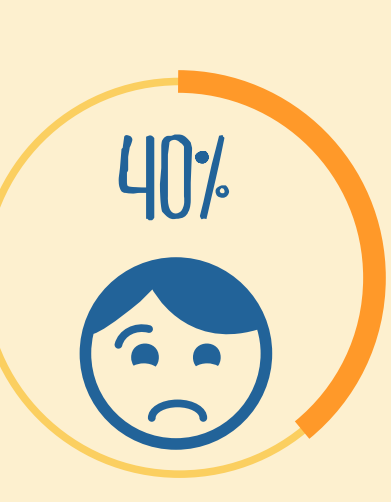
of children in the U.S. who needed mental health treatment did not recieve it