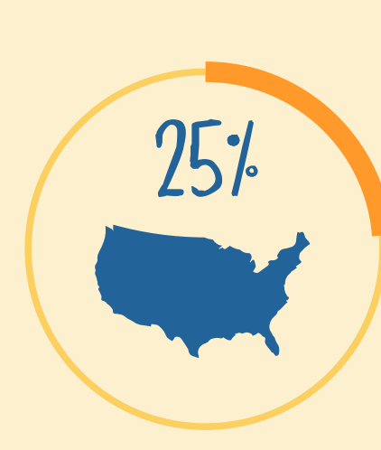
are of Hispanic origin