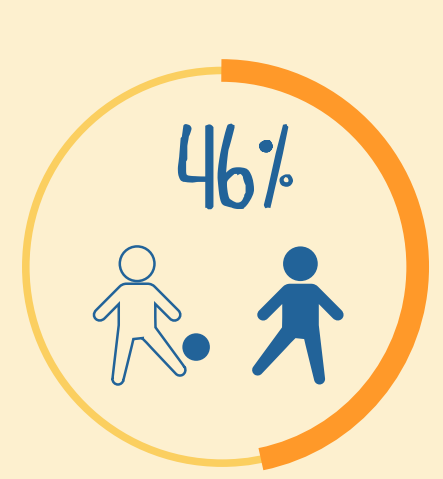
of children in the U.S. have experienced at least one adverse childhood experience (ACE)