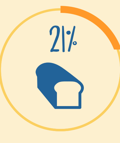
of all U.S. children of all U.S. children live in a food insecure household